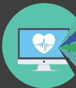
Welch Allyn CardioPerfect WorkStation Software

The Welch Allyn ABPM 7100 connects with CardioPerfect Workstation software to enable you to easily create, print and customize detailed reports: