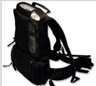
◀ Backpack accessory is also available for the G3.